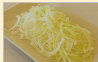
Vinegar Sliced Onions